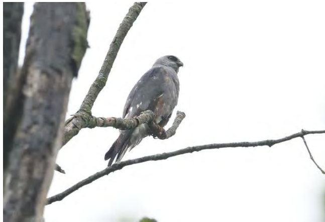
Kite Enjoying the Cicadas.

With the time constraints of work and family commitments, I do most of my birding solo in the bits and pieces of time that I can carve out of a busy schedule. Sometimes it is a quick scan of a lake in between dropping off one child and picking up another, a half-hour walk at lunch, or waking up early to get in some birding before running errands. These short birding efforts keep me attuned to the comings and goings of migrants and the timing of nesting behaviors, and only occasionally will I stumble into a notable or rare sighting.