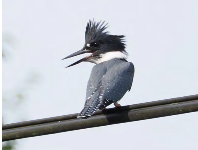
Belted Kingfisher, Little Fishing Creek, Columbia County.

Conifer plantings can often be found along backroads. There were often intended as ornamental plantings, windbreaks, or erosion control plantings. Some of the best ones are old CC Camps, often with tall Norway spruces and Red Pines. This is a place to find Golden-crowned Kinglets, Red-breasted Nuthatches, Blackburnian Warblers, and Pine Warblers. You often can find big old trees along the backroads, relicts of old yards and farms. Lilac bushes indicate the site of an old latrine. I have found many abandoned houses, sheds, and barns along roads as well as old stone walls. Old apple trees are full of cavities.