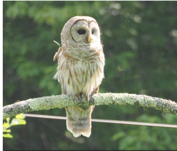
Barred Owl perched in daylight , Sullivan County.

Another great adventure to have on the backroads is to search for night birds. Eastern Whip-poor-wills will sit on