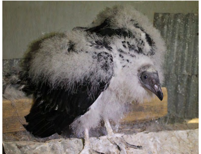
Turkey Vulture ( Cathartes aura ). This nestling at an abandoned barn near Curllsville, Clarion provided an uncommonly convenient opportunity to study the nesting habits of the species in July. The bird is shown here 13 July 2012, a few weeks before it fledged. (Jeff McDonald)