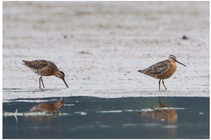
Short-billed Dowitcher ( Limnodromus griseus ). Harbingers of an outstanding fall for shorebirds at Shenango Reservoir, Mercer , these two hendersoni adults were photographed on the flats there 29 July 2012. (Jeff McDonald)