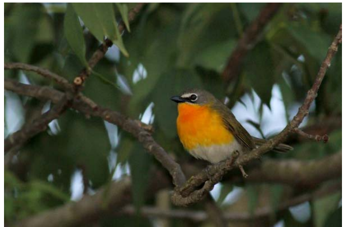
Yellow-breasted Chat ( Icteria virens ). Unusual in Centre , this male chat was nicely captured at Bald Eagle State Park 13 June 2012. ( Alex Lamoreaux )