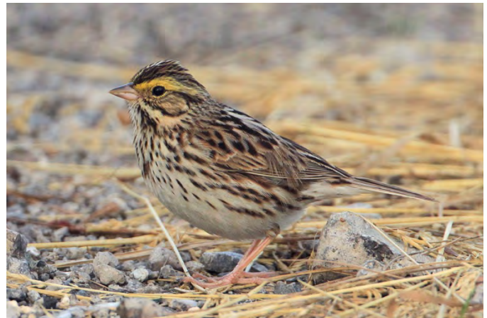
Savannah Sparrow ( Passerculus sandwichensis). Another fixture along Garrett Road in Mercer alongside the Dickcissels was Savannah Sparrow. This gorgeous portrait was made there 2 June 2012.