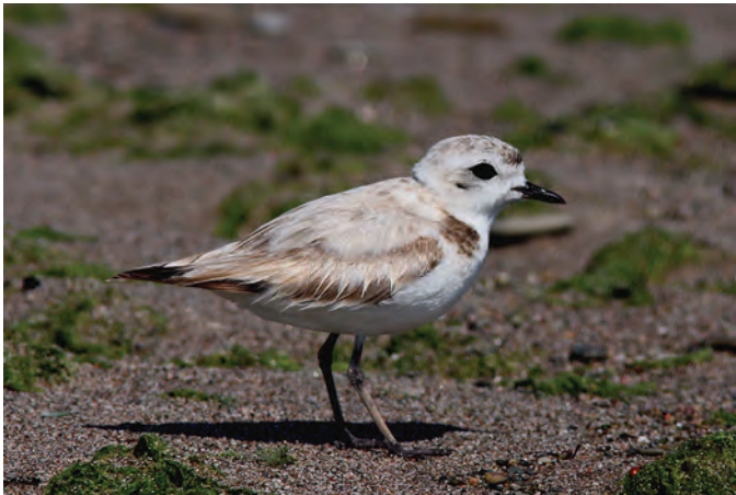
Snowy Plover, Erie County. See p. 168.