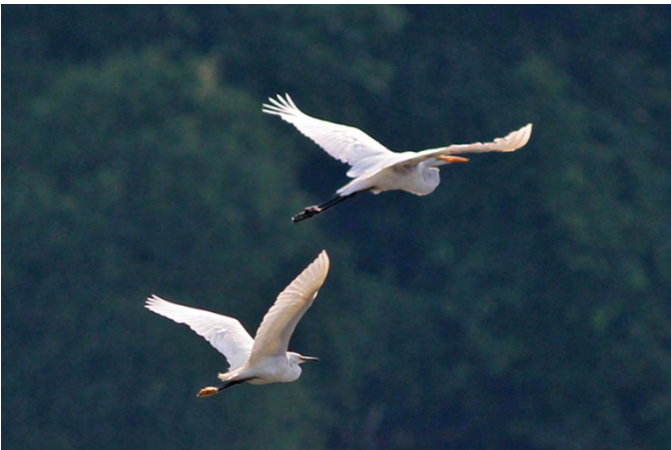
Snowy Egret ( Egretta thula ). This nice comparison shot of a snowy (below) with a Great Egret was made at Washington Boro, Lancaster 1 July 2012. (Meredith Lombard)