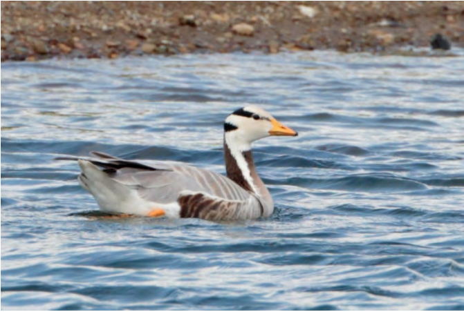
Bar-headed Goose. This handsome bird turned up at a gravel pond in southern Lawrence for a few days in early June, here 3 June 2012. It was wary and spent its time closely associated with a flock of Canada Geese. Interestingly, a Bar-headed Goose (very likely the same bird) spent a few weeks in April at a pond about 50 miles to the south in northern Washington . (Geoff Malosh)