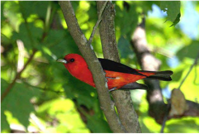
Scarlet Tanager ( Piranga olivacea). A characteristic bird of Penn's Woods, the Scarlet Tanager nonetheless can be difficult to photograph on territory here. This worthy image was made at Sproul State Forest, Clinton 6 June 2012.