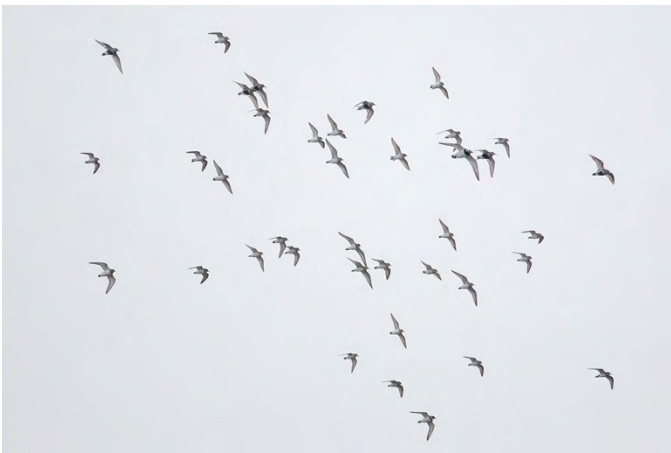
Shorebirds. Gull Point is nowadays a shadow of its former self, but spring storms still bring flocks of shorebirds and plenty of excitement to birders willing to undertake the long and difficult walk to the end. This flock of shorebirds, containing at least six species, was made at the Point during rainshowers 1 June 2012. (Geoff Malosh)