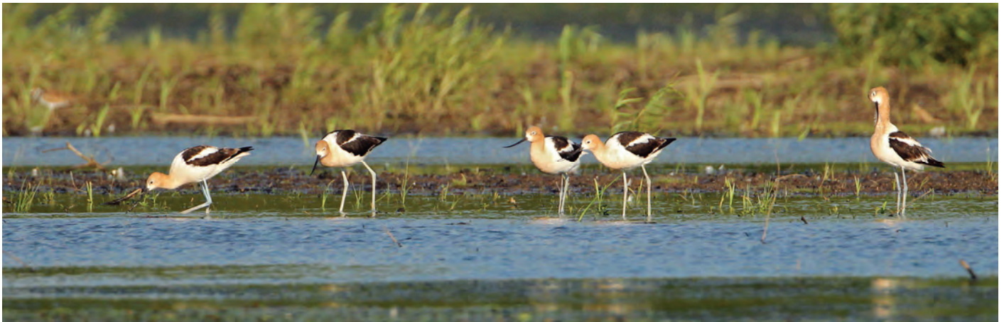
American Avocets, Indiana County. See p. 171 (Jeff McDonald)

PUBLICATION SCHEDULE: Materials to be included in the publication are needed by the due dates below.