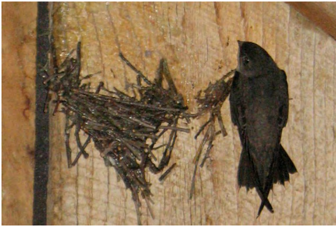
Chimney Swift ( Chaetura pelagica ). This juvenile at nest was photographed at a long-established nest site (in the attic of an outbuilding) near New Era, Bradford 31 July 2012, providing another convenient look at a hard-to-observe nester (see also the image of a young Turkey Vulture on p. 153). ( Trudy Gerlach )