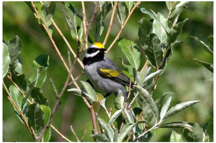
Golden-winged Warbler ( Vermivora chrysoptera ). Ever more difficult to find in the commonwealth, each encounter with a golden-wing these days is something to be appreciated. This male was at Bald Eagle State Park, Centre 16 June 2012.