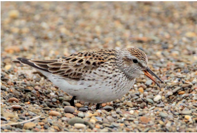
White-rumped Sandpiper ( Calidris fuscicollis ). The bright breeding plumage of this handsome adult White-rumped Sandpiper nonetheless appeared cryptic as the bird stood among a field of small multicolored pebbles at Gull Point, Erie 2 June 2012. (Jeff McDonald)