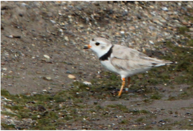
Piping Plover ( Charadrius melodus ). Piping Plover is rare enough at Presque Isle State Park, Erie , but it is rarer still away from Gull Point. This banded adult was photographed at Sunset Point 13 July 2012.