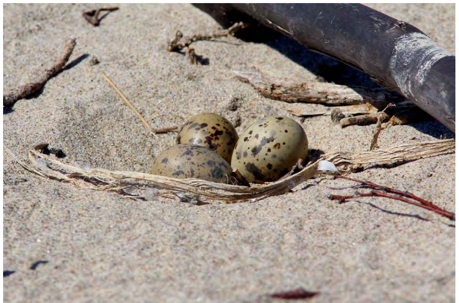
Figure 2. Three Common Tern eggs at the second 2012 nest site at Gull Point, 9 July.

The greatest challenge to nesting terns and Piping Plovers at Gull Point is probably not people, but predatory animals and birds. Predatory mammals that patrol the point fairly regularly are coyotes, raccoons, striped skunks, opossums, and American mink. Avian predators include Ring-billed, Herring, and Great Black-backed gulls, and Peregrine Falcons. Gulls are present on Gull Point every day, so they may be the greatest avian threat to nesting birds. It may take several pairs of nesting Common Terns in close proximity to each other to keep predators at bay. If terns can establish a breeding colony this would bode well for nesting Piping Plovers, since several territorial Common Terns can be quite persuasive in keeping