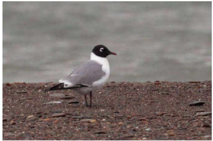
Franklin's Gull ( Leucophaeus pipixcan ). Quite unexpected was this adult Franklin's Gull at Gull Point, Erie 1 June 2012, during the passage of a front. Interestingly, an adult Laughing Gull was seen at Gull Point periodically in the first half of June as well.