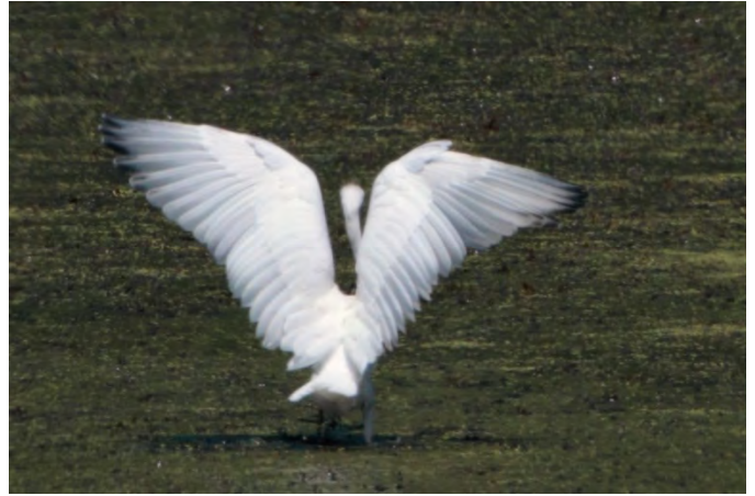
Little Blue Heron ( Egretta caerulea ). Rare in western Pennsylvania, this juvenile Little Blue (note the dark blue primary tips) spent several weeks at a small marsh near New Galilee, Lawrence , shown here 29 July 2012.