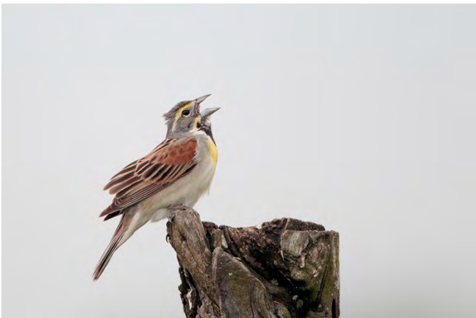
Dickcissel ( Spiza americana ). Grasslands in an Amish area of southern Mercer along Garrett Road were a hotbed of Dickcissel activity in June and early July. At least four birds were present, including this male, shown here 3 June 2012. (Geoff Malosh)