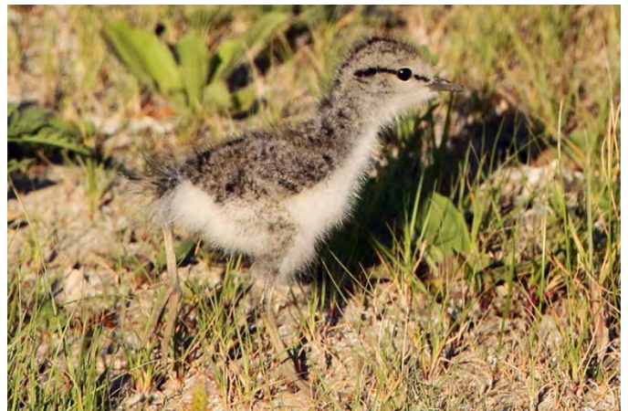
Spotted Sandpiper ( Actitis macularius ). This fluffy fledgling was nicely photographed at Bald Knob, Allegheny 25 June 2012. (Jeff McDonald)