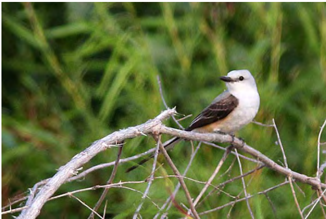
Scissor-tailed Flycatcher ( Tyrannus forficatus). Quite unexpected was this scissor-tail at Gull Point, Erie 8 June 2012, which provided just the second record for Erie. The bird was present for only one day.