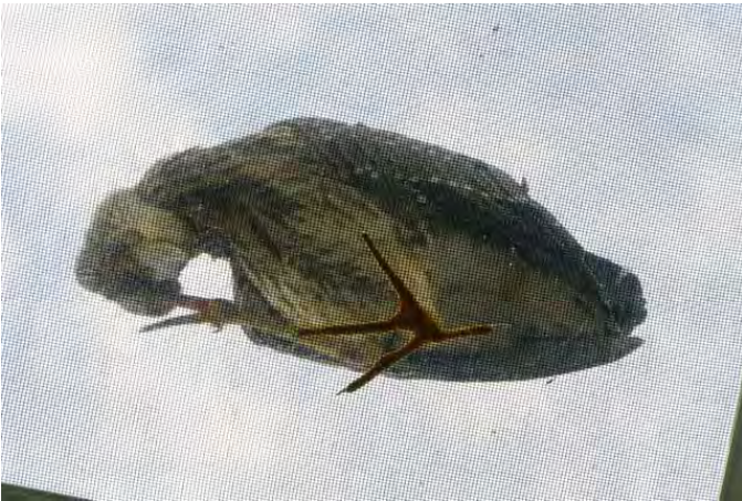
Yellow-crowned Night-Heron ( Nyctanassa violacea ). Yellow-crowns have recently taken to nesting in a densely suburban neighborhood in Harrisburg, Dauphin , where they tolerate a tenuous, and sometimes comical, proximity to humans. This juvenile was photographed 28 July 2012 from inside a house as it perched atop a skylight, totally unaware of—or unconcerned with—the amused humans within. (Dot Montaine)