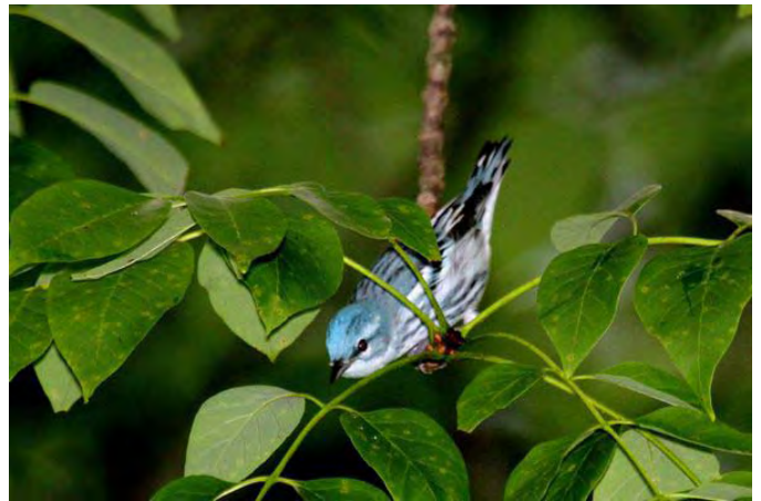
Cerulean Warbler ( Setophaga cerulea). Very difficult to photograph at eye level, this sharp portrait was made at Hyner, Clinton 19 July 2012.