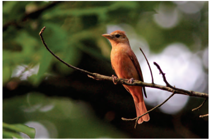
Summer Tanager, Lebanon County. See p. 173