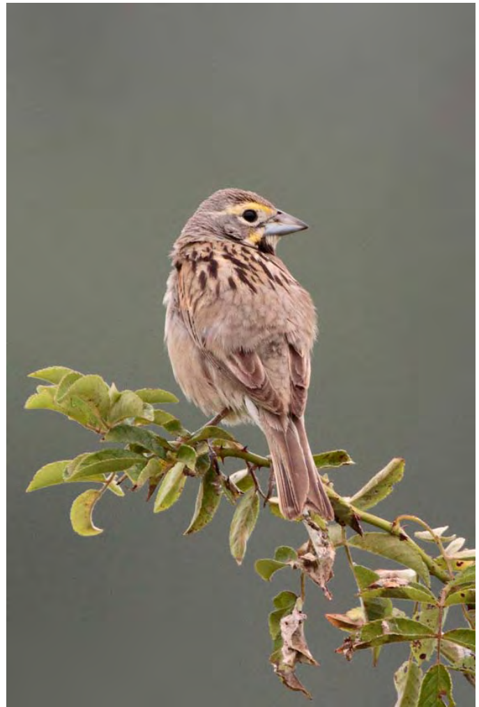
Dickcissel ( Spiza americana ). Dickcissels appeared in all corners of the state this season. This female was present at Palm, Montgomery 15 July 2012. (Dustin Welch)