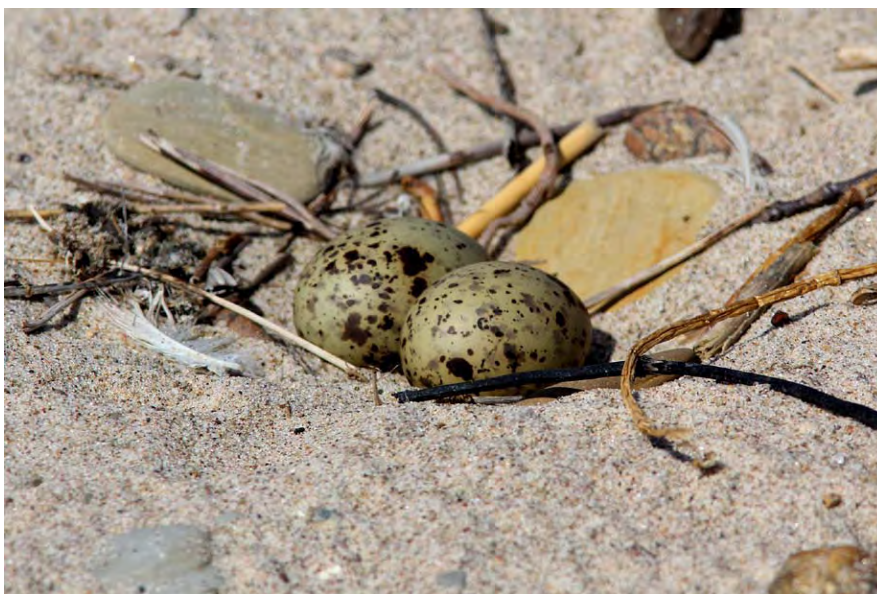
Figure 1. Two Common Tern eggs at the first 2012 nest site at Gull Point, 22 June. (Jerry McWilliams)