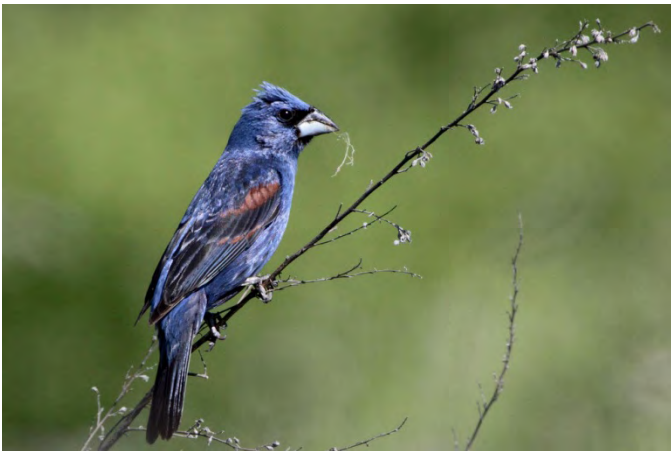
Blue Grosbeak ( Passerina caerulea ). Always a highlight of a day birding in the southeast of Pennsylvania, this handsome male was photographed at Martins Creek, Northampton 27 June 2012. (Dustin Welch)