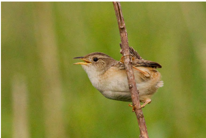
Sedge Wren ( Cistothorus platensis). Yet another unexpected bird in Erie this season was this wren using an unmown field at the Fairview Business Park in early June, shown here the day it was first found, 2 June 2012.