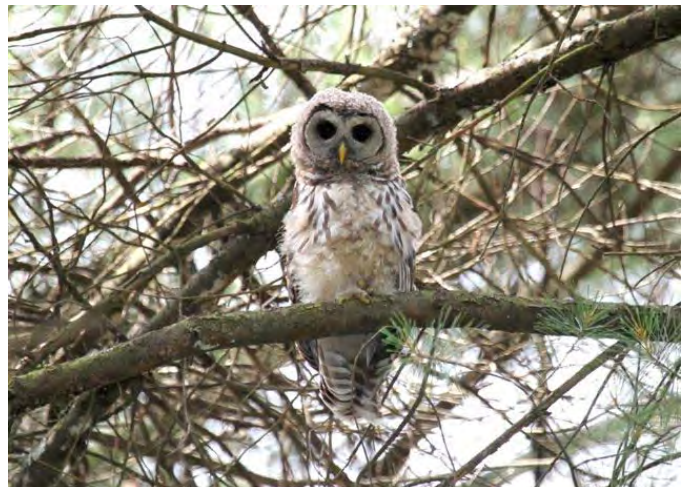
Barred Owl ( Strix varia ). Always confiding when they can be located, this fledgling Barred Owl was nicely photographed at Farrandville, Clinton 30 June 2012.